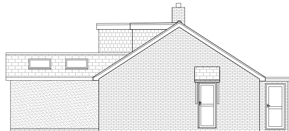
PROPOSED LEFT ELEVATION