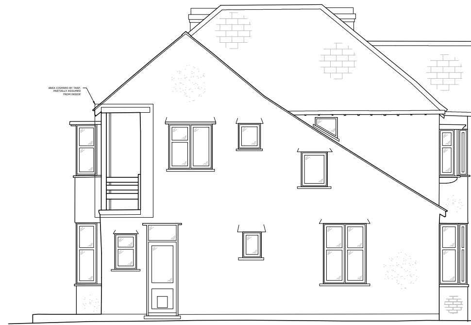
EXISTING LEFT ELEVATION SCALE 1:100