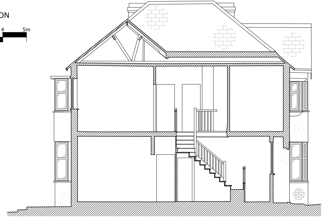
SECTION A-A SCALE 1:100